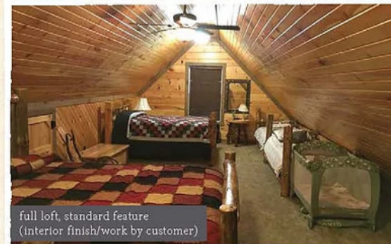
full loft, standard feature (interior finish/work by customer)