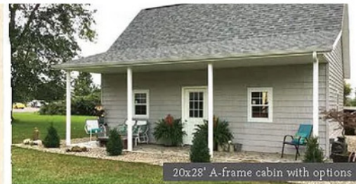
20x28' A-frame cabin with options