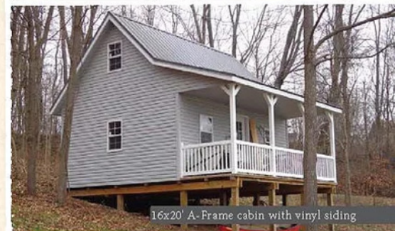
16x20' A-Frame cabin with vinyl siding