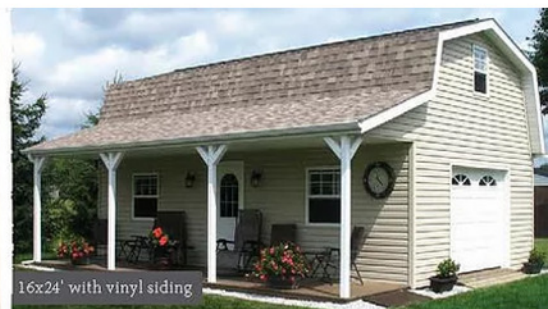
16x24' with vinyl siding