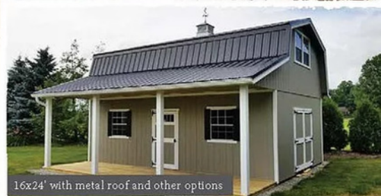
16x24' with metal roof and other options