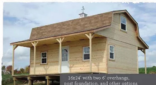
16x24' with two 6' overhangs, post foundation, and other options