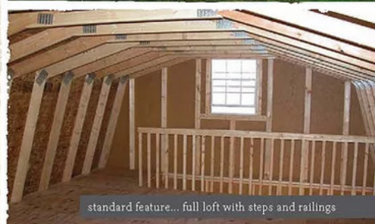
standard feature... full loft with steps and railings