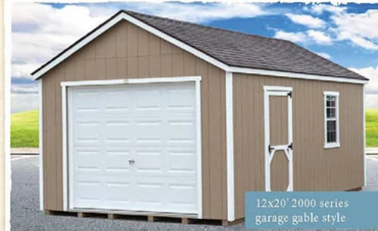
12x20' 2000 series garage gable style