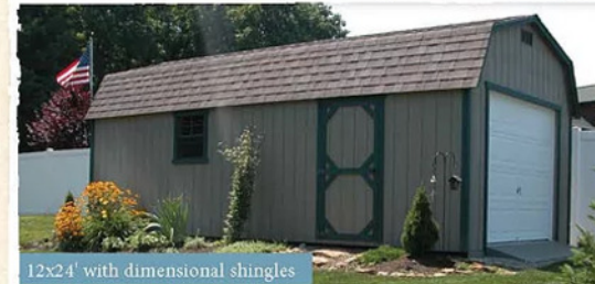
12x24' with dimensional shingles