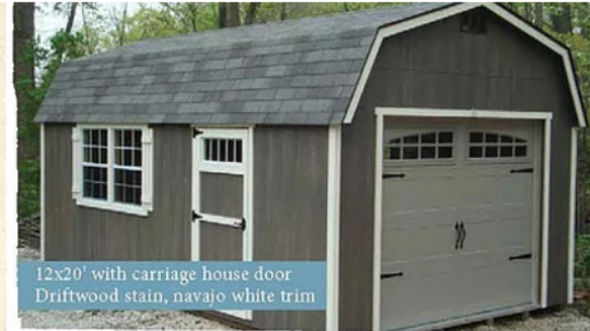
12x20' with carriage house door Driftwood stain, navajo white trim