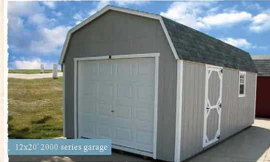
12x20' 2000 series garage