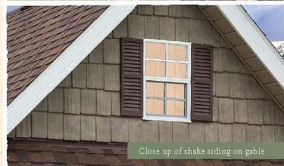
Close up of shake siding on gable