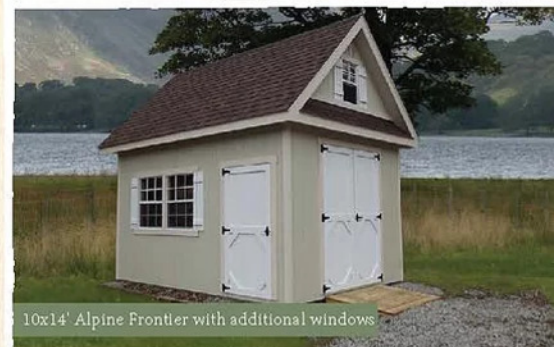
10x14' Alpine Frontier with additional windows