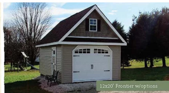
12x20' Frontier w/options