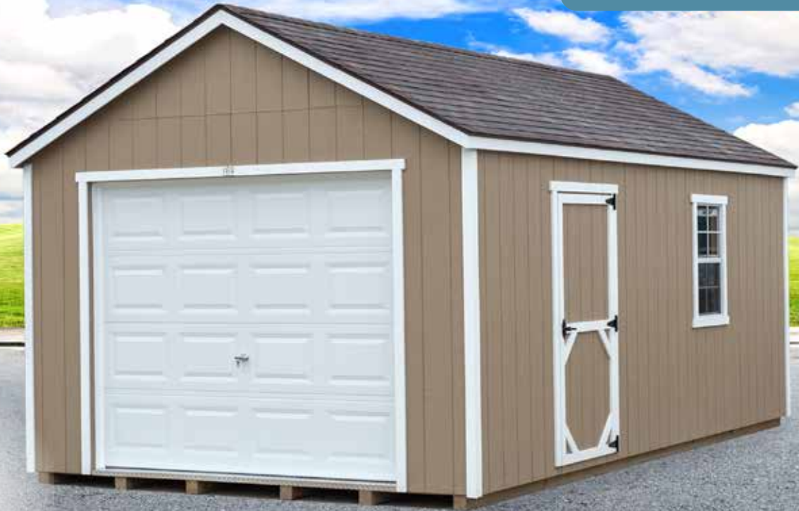
12x20' 2000 Series Gable Garage options shown: standard features painted buckskin with white trim