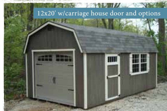
12x20' w/carriage house door and options