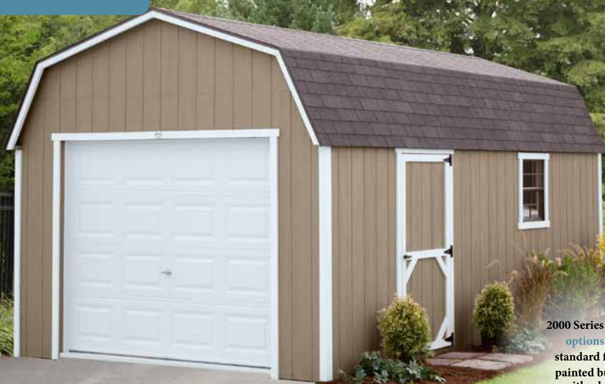
12x20' 2000 Series Garage options shown: standard features painted buckskin with white trim