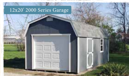
12x20' 2000 Series Garage