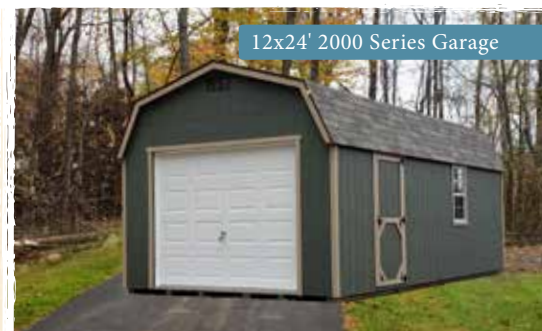
12x24' 2000 Series Garage