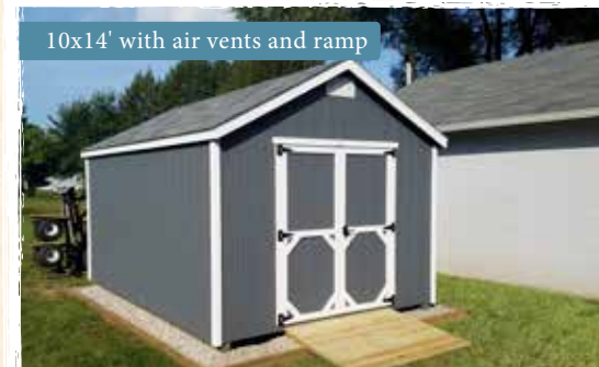
10x14' with air vents and ramp