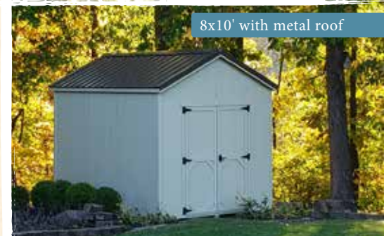
8x10' with metal roof