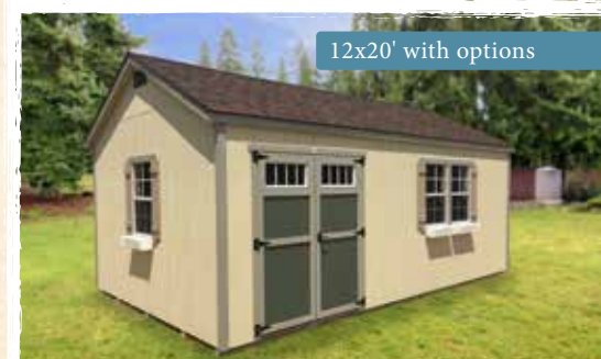
12x20' with options