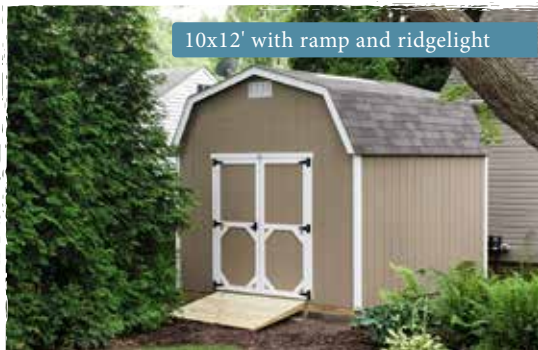
10x12' with ramp and ridgelight