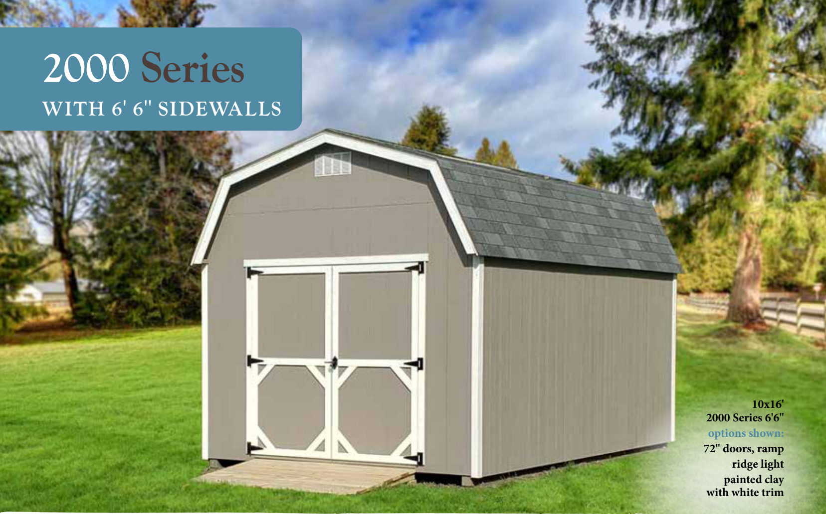
10x16' 2000 Series 6'6" options shown: 72" doors, ramp ridge light painted clay with white trim