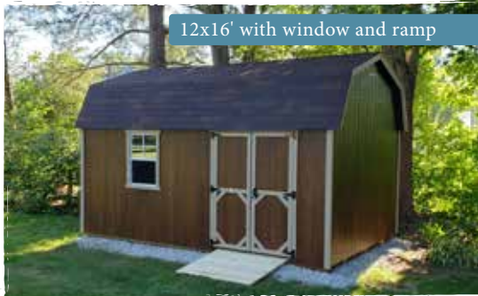
12x16' with window and ramp