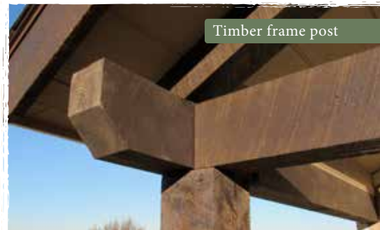
Timber frame post