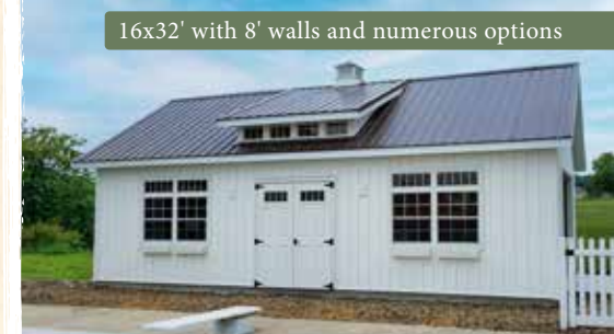
16x32' with 8' walls and numerous options