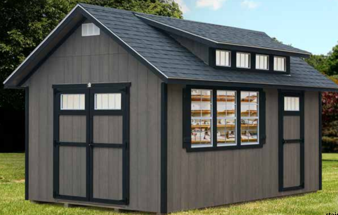
10x16' Skyview options shown: transom windows extra 24x36" window stained driftwood with black trim