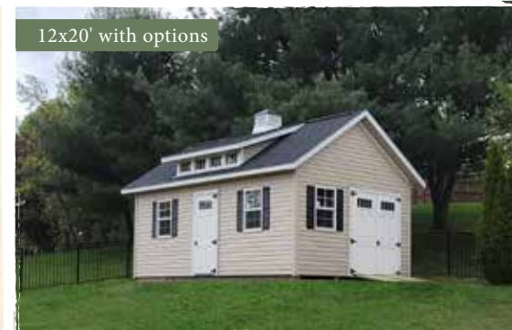
12x20' with options