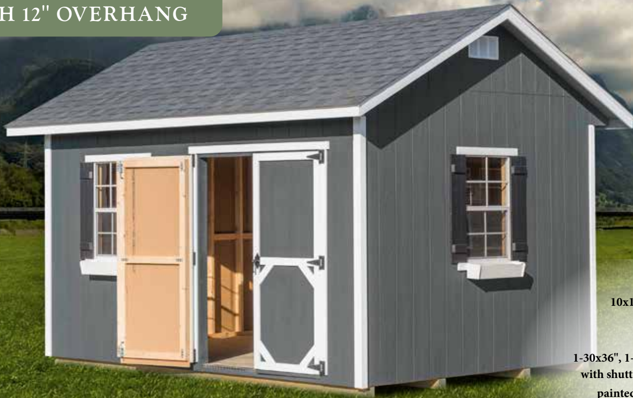
10x14' Alpine Gable options shown: elite package 1-30x36", 1-24x36" window with shutters & flowerbox painted dark grey with white trim, black shutters