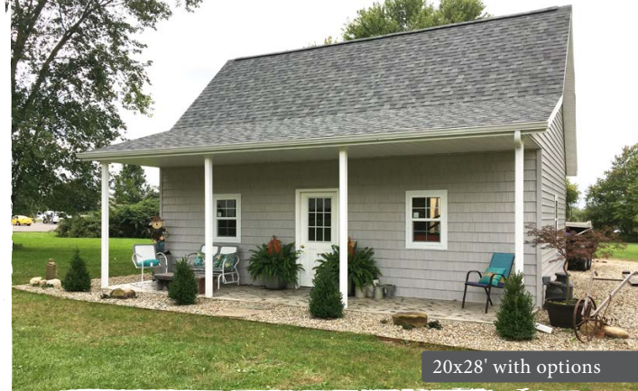
20x28' with options