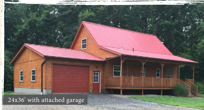
24x36' with attached garage