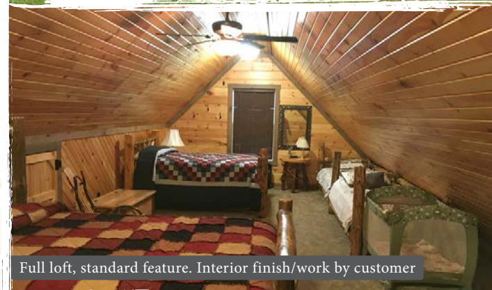
Full loft, standard feature. Interior finish/work by customer