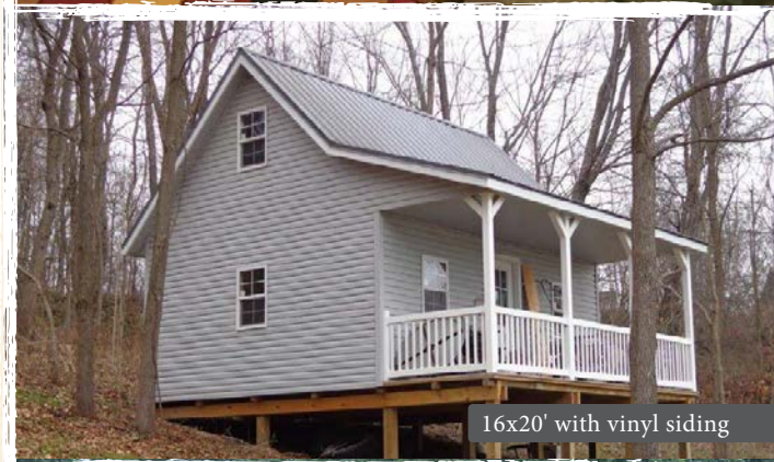
16x20' with vinyl siding