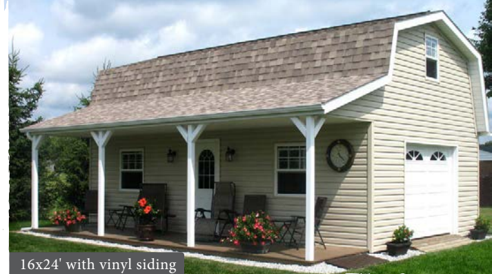
16x24' with vinyl siding