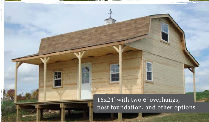
16x24' with two 6' overhangs, post foundation, and other options