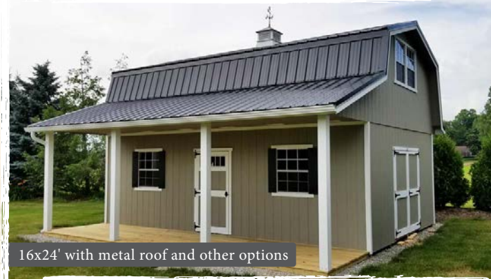
16x24' with metal roof and other options