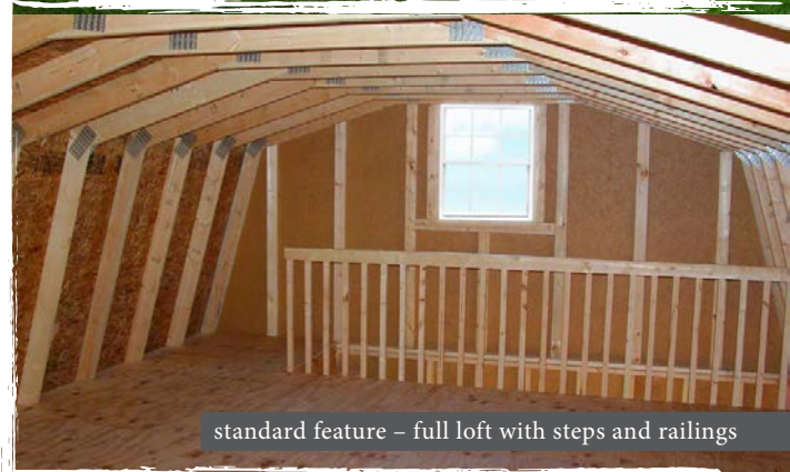
standard feature – full loft with steps and railings