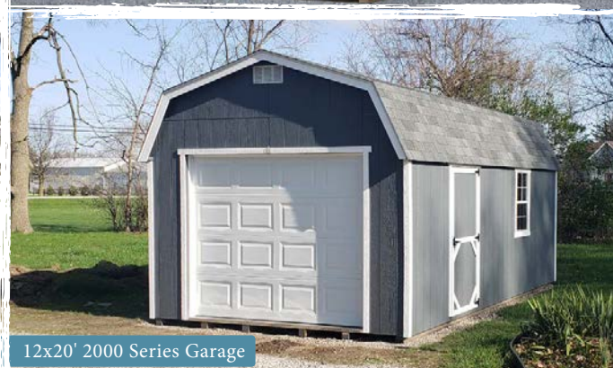
12x20' 2000 Series Garage