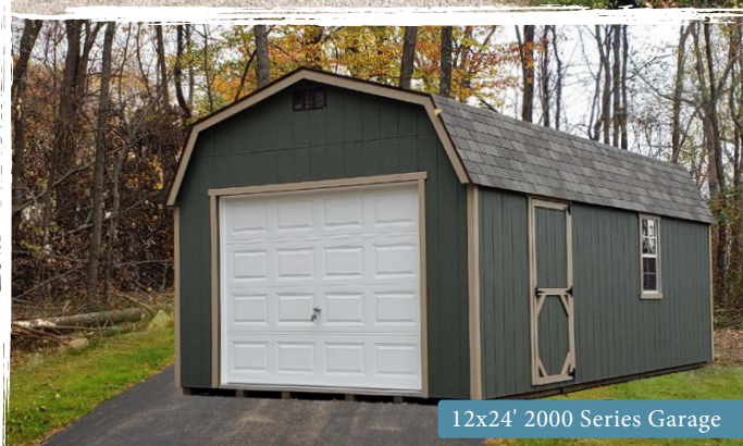
12x24' 2000 Series Garage