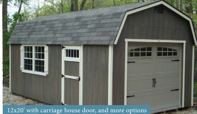
12x20' with carriage house door, and more options