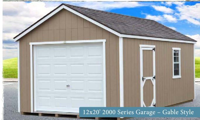
12x20' 2000 Series Garage – Gable Style