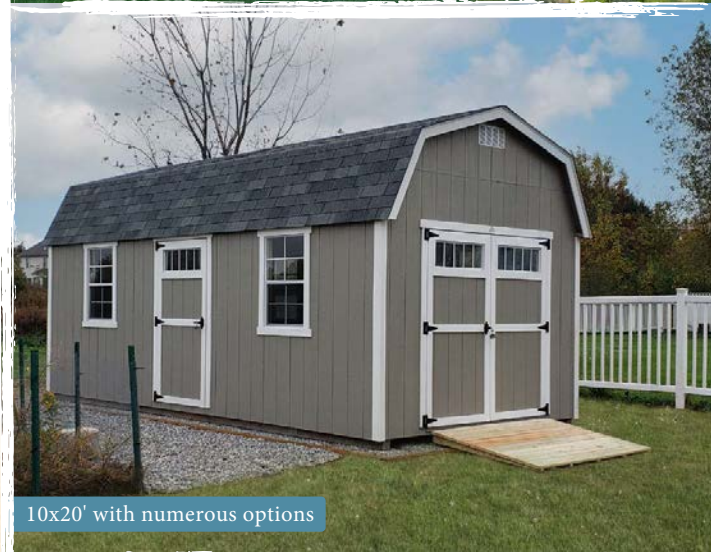
10x20' with numerous options