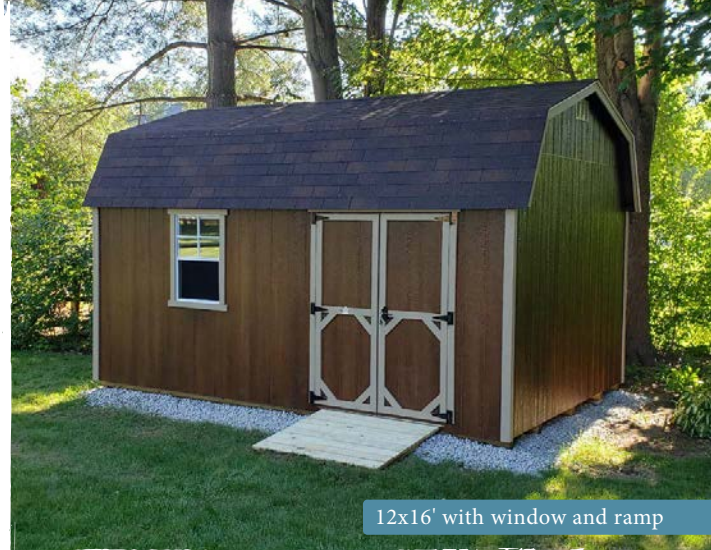
12x16' with window and ramp